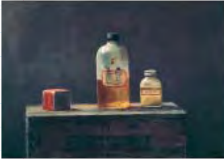
Painting Media 1980 oil on panel 16 x 20 inches