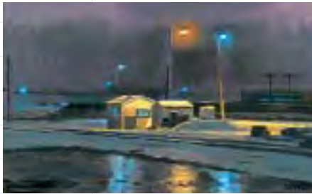
Yard Shanty 1994 oil on panel 12 x 18 inches

Lynch's paintings are saturated with melancholy—even his nature scenes feel restrained and lonely. He notes laconically that “trees are hard to paint with all those leaves” and says he prefers to depict them at night when they become solid masses of shadow. But for this master painter, the resistance to conventional beauty is