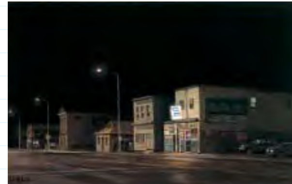
Smitty's Bar 1992 oil on panel 13½ x 22 inches

Greg Brown Singer-Songwriter Hacklebarney, Iowa