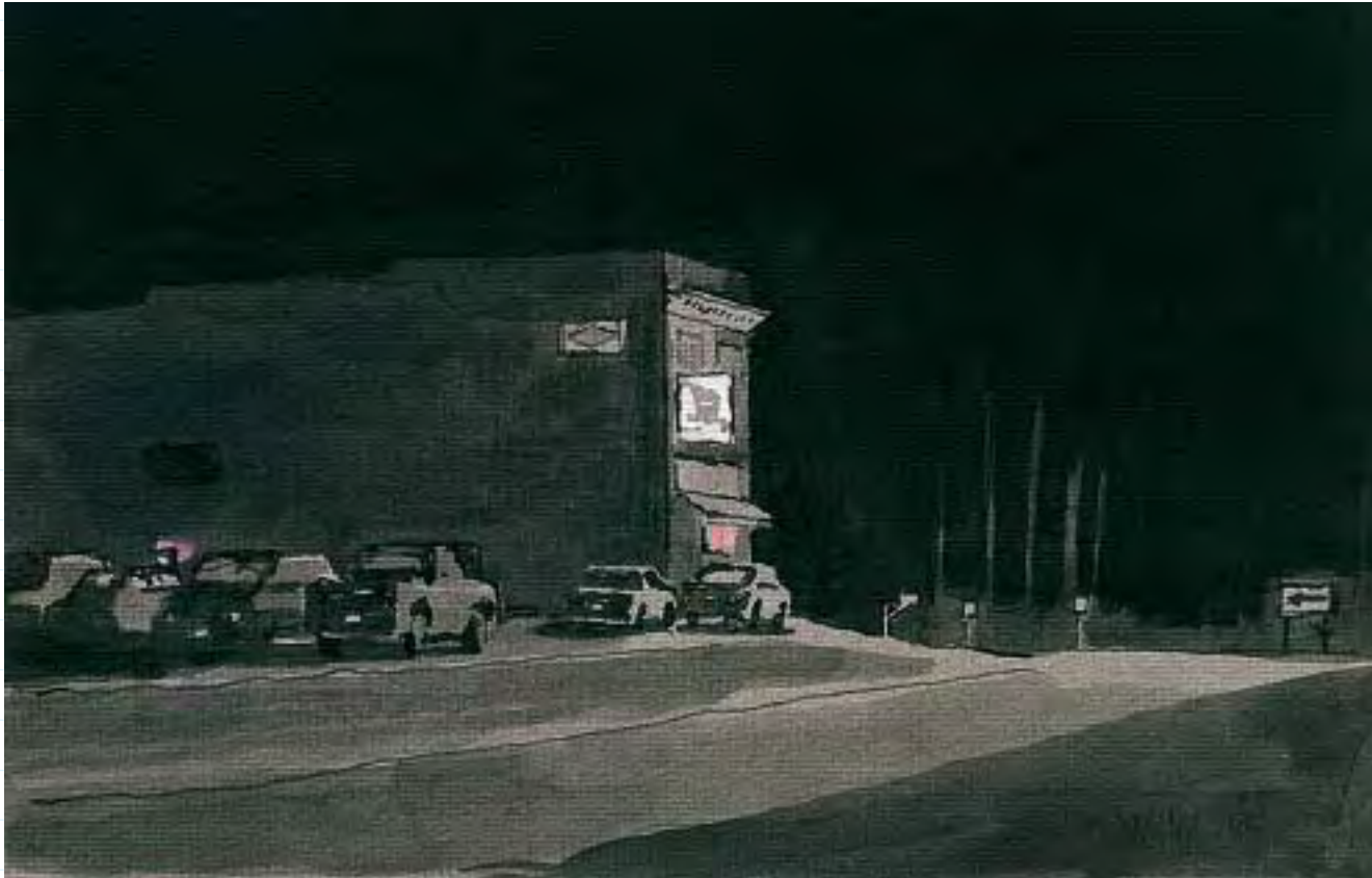
Saturday Night at the Palace 1994 ink and watercolor on gray paper 5 1/2 x 9 inches