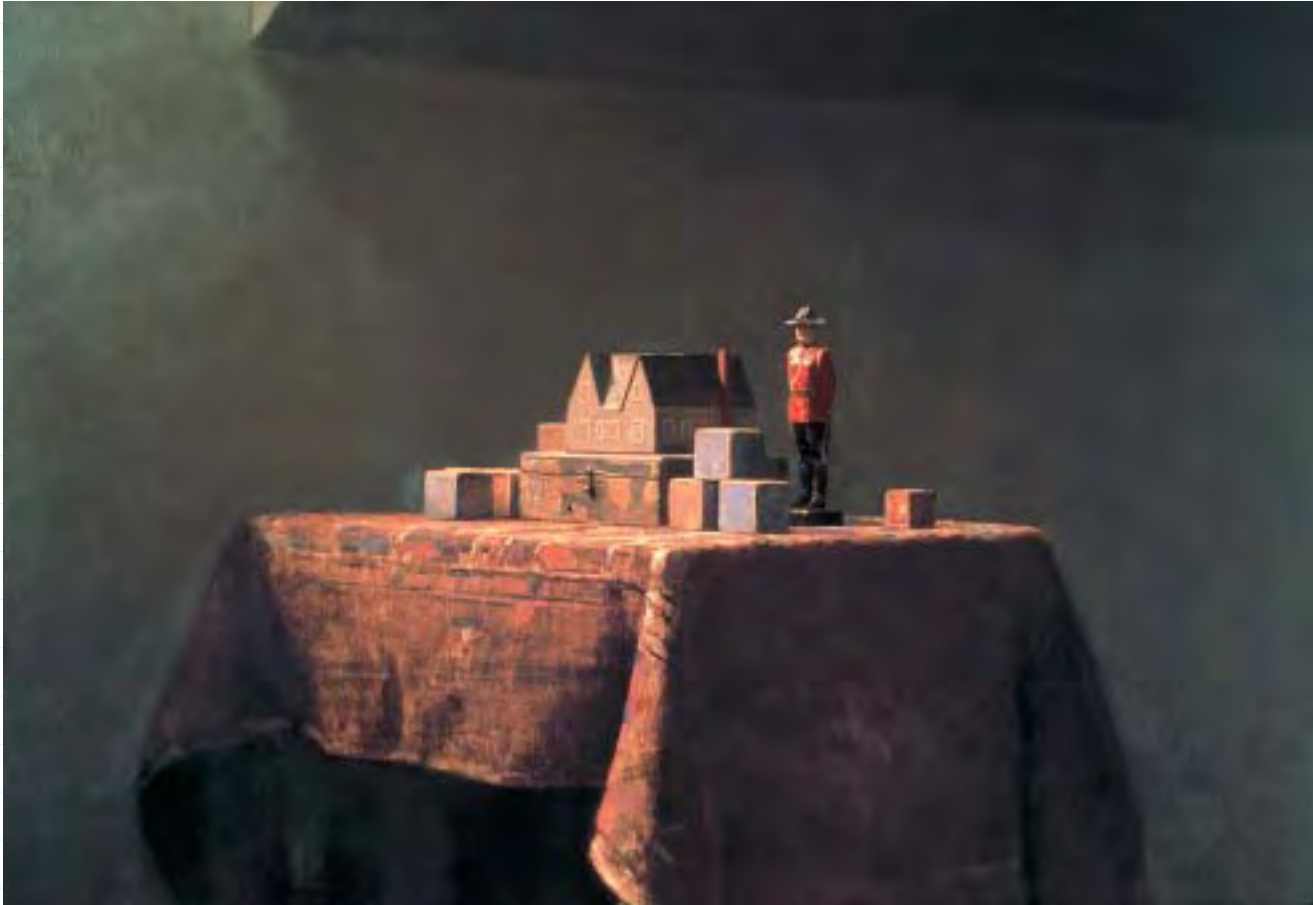
Mountie 1980 oil on canvas 36 x 48 inches