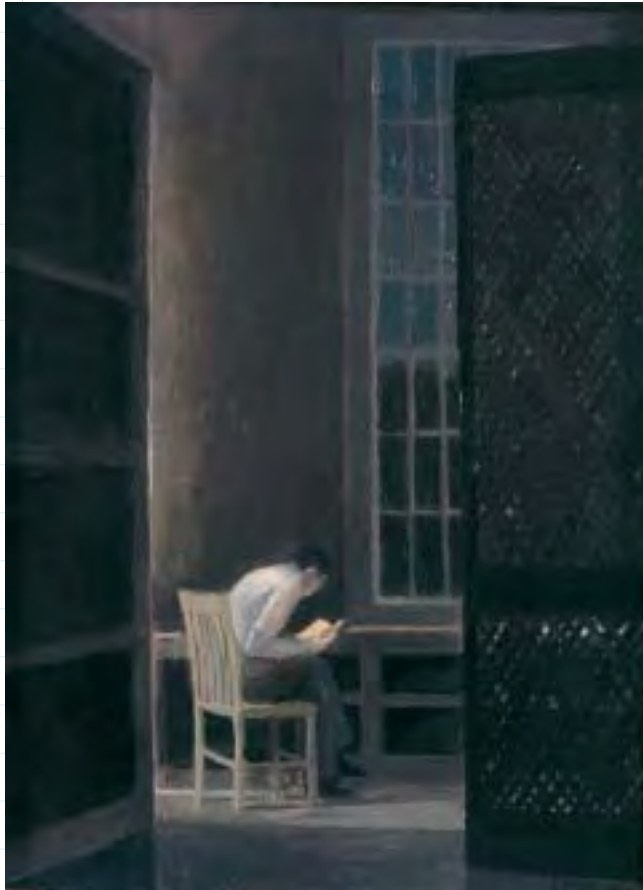
Pop at the Mine 1958 oil on canvas 16 x 12 inches