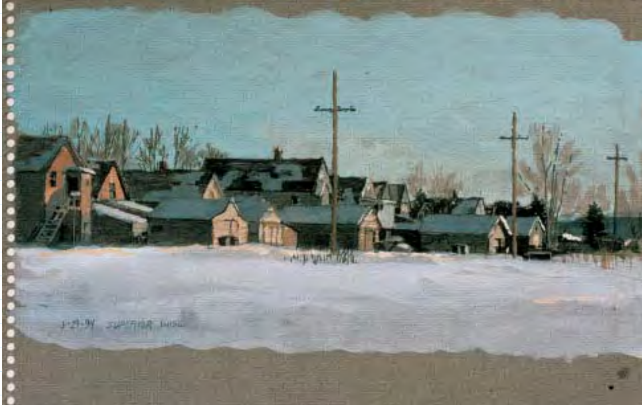
Houses, Superior West 1994 ink and gouache on gray paper 5 1/2 x 9 inches