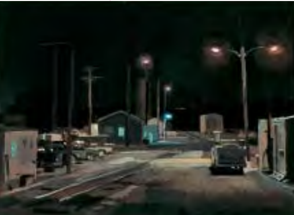
Rail Yard Nocturne 1992 oil on panel 16 x 22 inches

Mike's work sneaks up on you. The stillness of his paintings and drawings is rich; the grayness is clear. The silence of his urbanscapes breathes. You begin to feel Mike's darkness and mystery before you see it, like the drumming of a grouse.