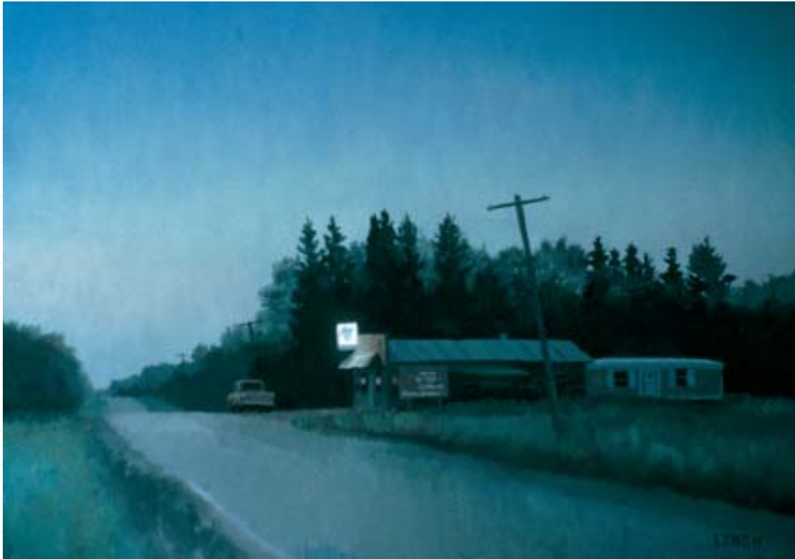
Moose Junction 1986 oil on panel 16 x 22 inches

Lynch draws our attention to the things we live with every day.