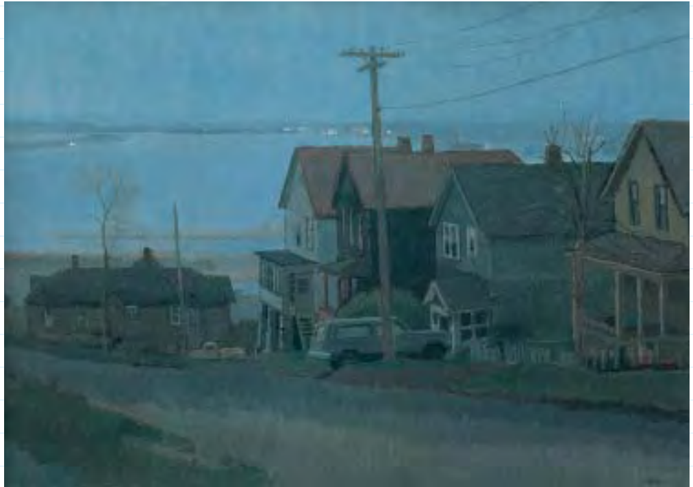
Harbor Lights 1983 oil on panel 16 x 22 inches