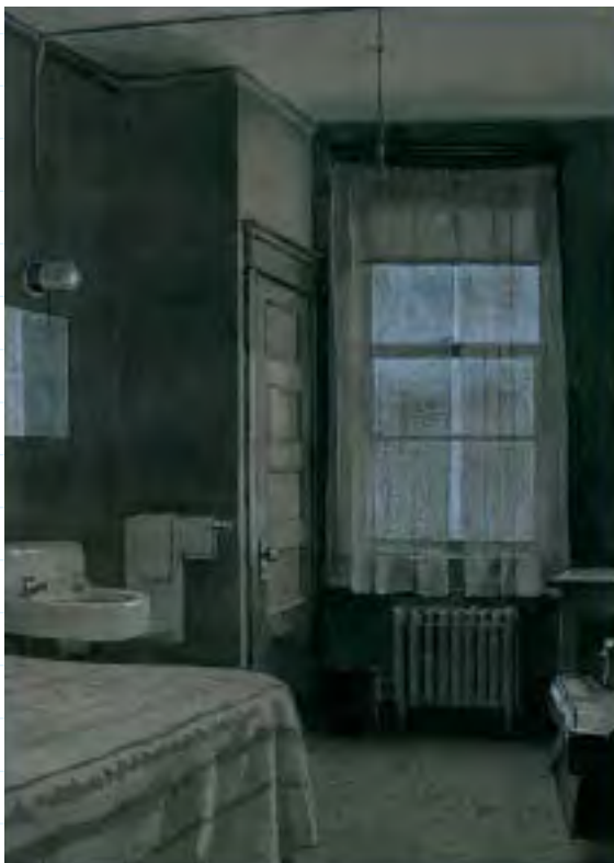
Room 431 1995 ink, Chinese white 14 x 10 inches

lamppost playing across the rounded shapes of a gigantic grain elevator; or—my favorite—a solitary street lamp against a pitch black sky illuminating the side view of a saloon, with a car and a couple of pickups parked outside in the snow. This, to me, is so evocative that I can picture again the dozens of similar taverns I used to drive past during my years in northern Minnesota. The bleak light, the frost on the vehicles, and the smoke rising from the chimney tell me that it's a very cold night. This, like most of his work, contains no human figures, and yet you can imagine the human presences inside the building.