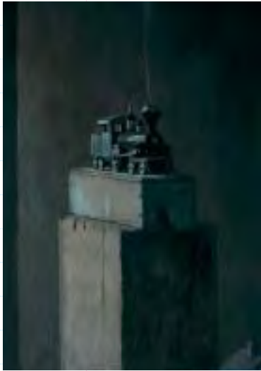
Locomotive 1983 oil on panel 22 x 16 inches