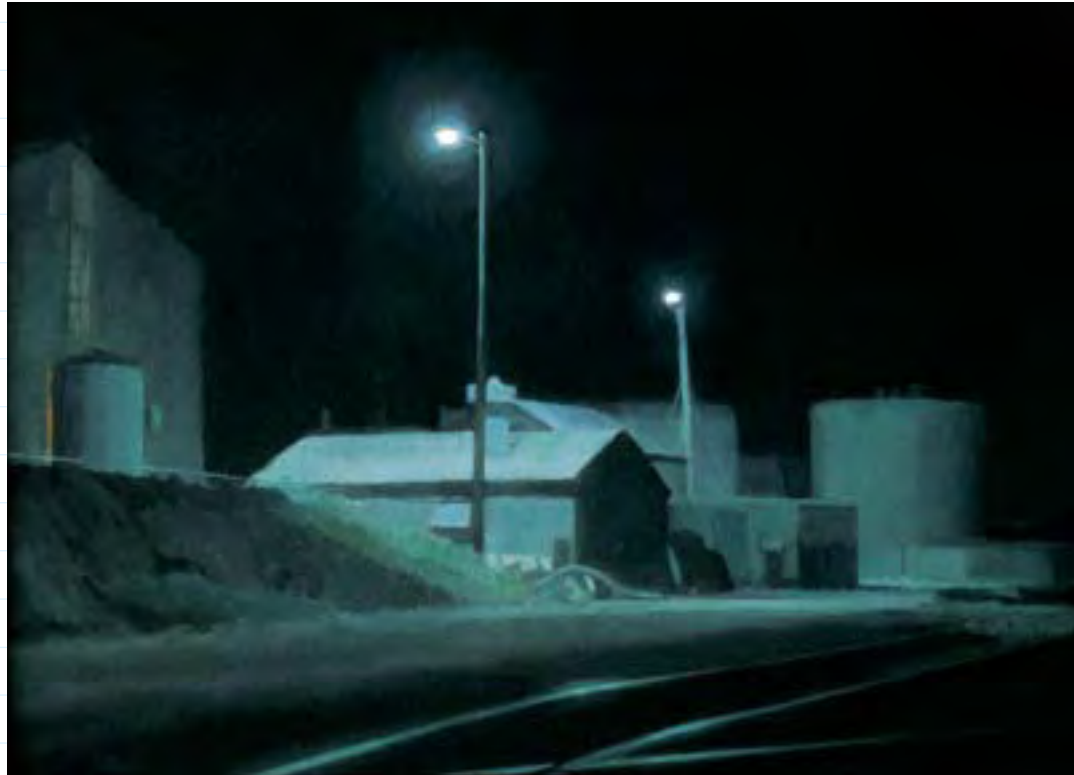
Marine Oil Company 1985 oil on panel 16 x 22 inches

“I’m more interested in architecture that has accumulated over time, rather than being designed. I like things that have just happened, that are weathered, added on.”